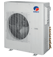
36K & 42K BTU/hr condensing units