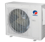
18K, 24K & 30K BTU/hr condensing units